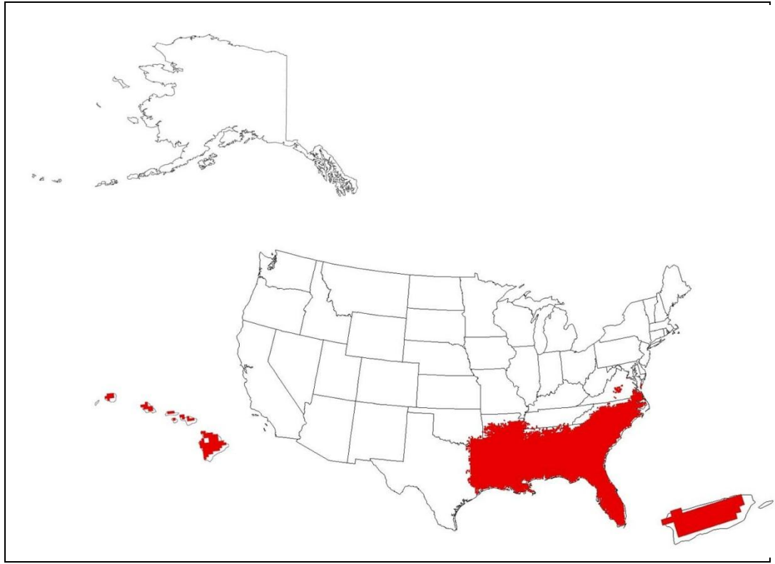
Figure 1. Predicted distribution of Nymphoides cristata in the United States. Map insets for Alaska, Hawaii, and Puerto Rico are not to scale.