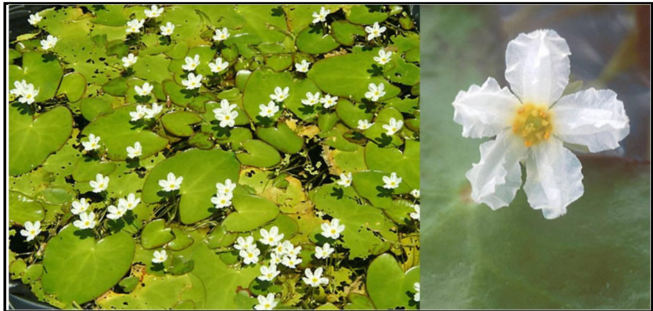
Left: A colony of Nymphoides cristata plants; right: Nymphoides cristata flower.