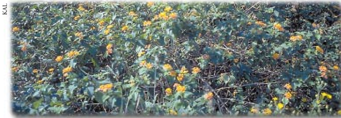
In Lake Jessup conservation area

Life History: Long recognized as highly toxic to grazing animals; has caused death in children when a quantity of unripe berries was eaten (Morton 1971b). Produces allelopathic substances in the roots and shoots, increasing its competitive ability (Smith 1985, Sahid and Sugau 1993). Strongly resists herbivory, contributing to its pest-plant status outside its natural range (Janzen et al. 1983). Can tolerate fire by regenerating from basal shoots (Smith 1985). Flowers year-round (or May to December in northernmost Florida). Seed dispersed by songbirds (Janzen et al. 1983). ‘Gold Mound’, ‘New Gold’, ‘Alba’, and ‘Patriot’ cultivars not known to produce viable seed in nursery or landscape plantings (S. Kent, Tree of Life Nursery, 1998 personal communication).