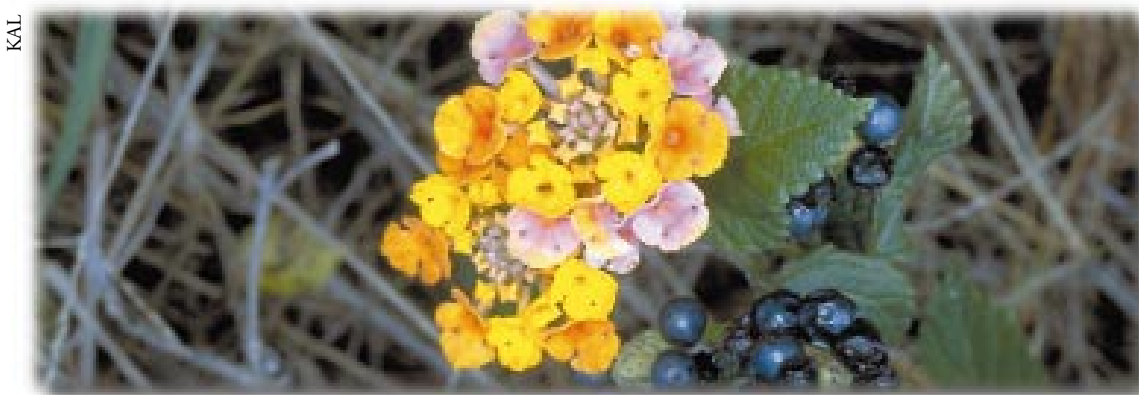
Fruits and multicolored flowers